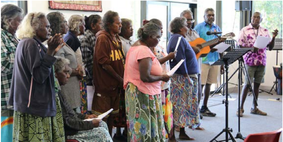
Worship at Nungalinya College in Darwin

for those we will raise financial support for during the Conference.