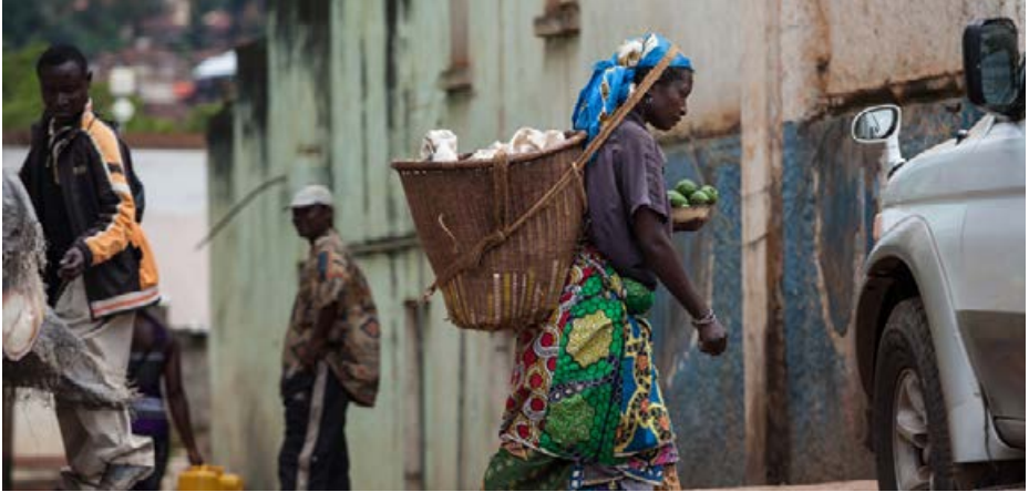
Bukavu, Democratic Republic of the Congo