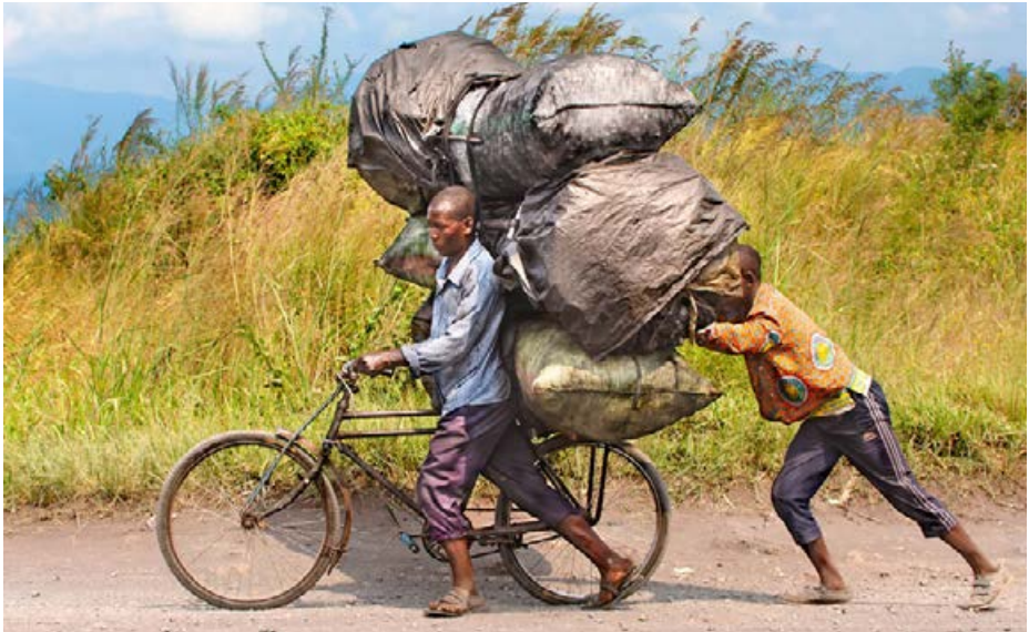
Goma, North Kivu, Democratic Republic of Congo