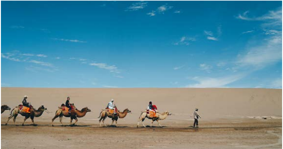
Dunhuang, Jiuquan, China

Practically – Figtree Anglican is willing to consider hosting events that promote the work of our Link Missions (e.g. Watoto Children’s Choir), provide practical support (e.g. Operation Christmas Child) and encourage members to consider a mission trip to support the work of the Link Mission (e.g. Compassion).