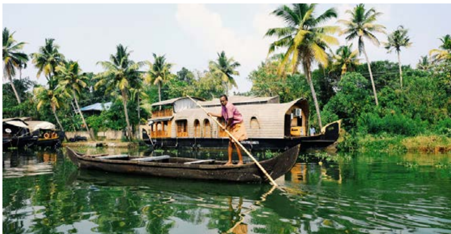
Kerala Backwaters, Alappuzha, India